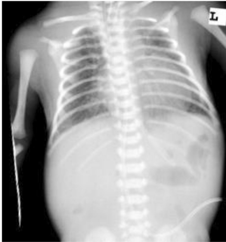
Fig. 2 Chest x-ray of case 2. Image date: 2020/03/05

had hypocalcemia 7.7 mg/dl and CSF, blood, and urine culture tests were negative during admission (Table 2).