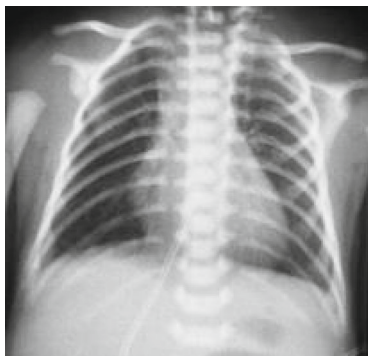
A: Chest x-ray of case 1 after surfactant therapy (2 hours after birth)

Antibiotic regimen was upgraded and meningitis was also ruled out by performing lumbar puncture and negative cerebrospinal fluid (CSF) culture. Moreover, we checked serum & CSF herpes simplex viruses (HSV) PCR which were also negative. The results of nasopharyngeal multiplex PCR tests (for enterovirus, adenovirus, and H1N1) were also negative. A massive pulmonary hemorrhage complicated his situation on day 4 after his birth. In such case, we decided to treat him by 5 mg/kg/day of hydroxychloroquine that was administered via feeding tube, considering the probable COVID-19 infection. Due to the persistent high fever despite administrating antibiotics for 5 days (excluding (Hemophagocytic Lymphohistiocytosis (HLA)), viral and bacterial sepsis as explained earlier), we conducted a pharyngeal swab test again for COVID-19 RT-PCR assay on day 7 after his birth time, and the RT-PCR test result for COVID-19 was positive at this time (Table 1). As he was still suffering from fever (39 °C Axillary), we continued the administration of